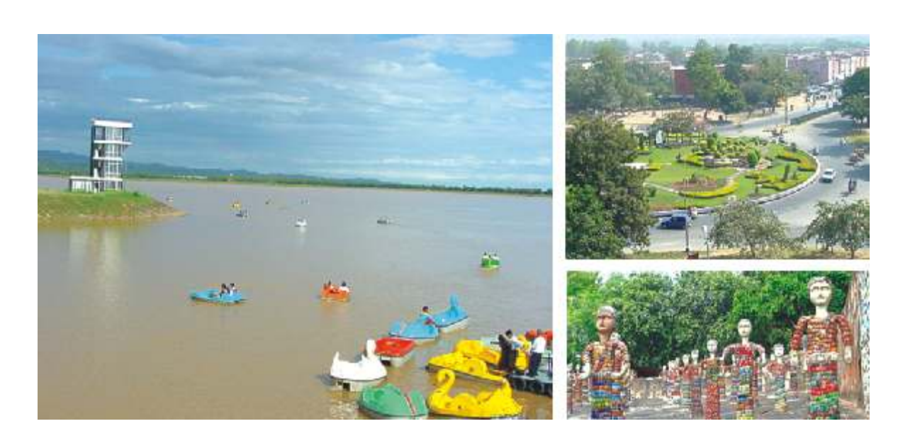
"We build homes.....not just houses"