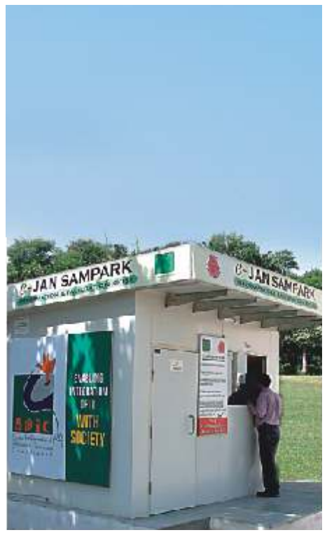
A citizen availing e-Jan Sampark Services

These services are provided free of cost except when the citizen needs any print out, the same is available at a nominal cost per page of print out. E-Jan Sampark services have been simultaneously launched from the Sampark Centres situated in Sector 10, Sector 15, Sector 18, Sector 23, Sector 43, Sector 47 Industrial Area and Mani Majra. The other sites in Phase I which have been identified for setting up of e-Jan Sampark Services are Sector 9, Sector 11, Sector 17, Sector 22, Sector 32, Sector 35, Sector 38, Sector 40 and Sector 45. These services will also be available in all the UT villages from the Gram Sampark Centres, which are likely to be launched in October 2006.